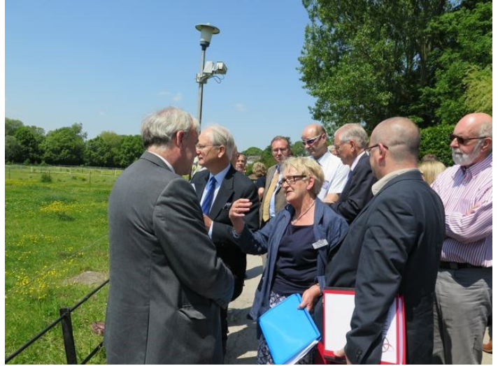
Select Committee MPs hear about local concerns at Stoke House

They heard about how HS2 will impact local businesses, farms, the village school and Booker Park school, the Old Church site, homes and people. Chairman of the Select Committee, Robert Sym was clearly impressed with the way the Parish Council and Action Group had worked pro-actively to develop solutions to local issues, such as the A4010 realignment.